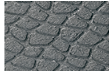
grip-surface: supports sure footing