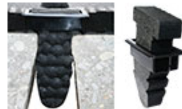
fastening system: patented rubber peg to prevent lateral slipping - flush with the mat

The benchmark for excellent walking comfort since more than 15 years for every slatted floor geometry