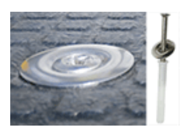
KRAIBURG fastening system: extremely sturdy, rounded off and flush with the mat