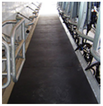
KARERA P in the milking parlour