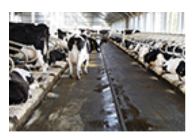
KARERA P in the walking alley