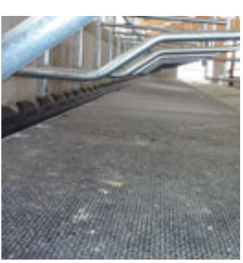
KIM LongLine in practice

• the supple, highly wear resistant air cushion profile creates pleasant and permanent lying comfort