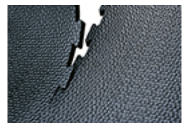
with puzzle seam