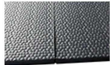
installation edge to edge