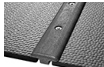
installation with KK-Poly-T-Bar e.g. for stall equipment with mushroom dividers or especially when using very fine litter