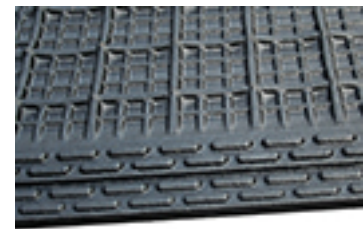
sealing lips in the rear section