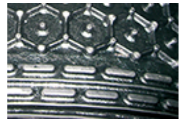
honeycomb texture with sealing lips