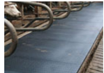
KKM LongLine in practice